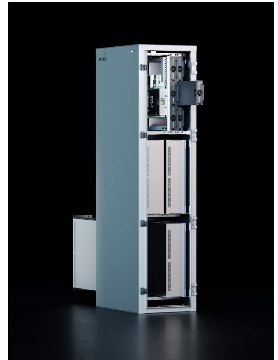
Pixii Home is modular, making it easy to add more batteries as your energy need changes.

Regular software updates ensure that your Pixii Home remains compatible with your grid. You can add more batteries as your energy need increases so that you can charge into the future with confidence!